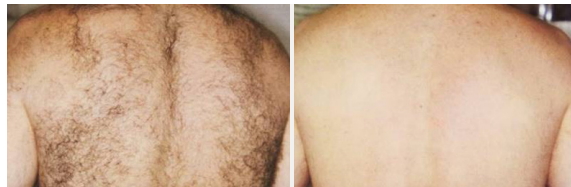
Before After 5 treatments

All photos are unretouched. Individual results may vary.