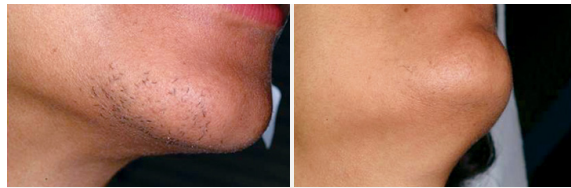
Before After 2 treatments

All photos are unretouched. Individual results may vary.