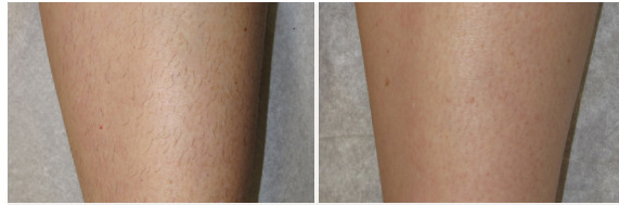
Before After 5 treatments

Remove unwanted hair anywhere on the body!